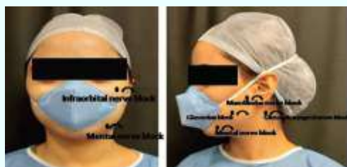
Customised face mask with landmarks

During COVID-19 pandemic, managing patients with uncontrolled cranial neuralgias may require nerve blocks on the face. The chance of acquiring COVID infection through aerosols becomes multifold if the patient's mask is removed. This problem was tackled by customizing the face masks by having a smaller footprint covering only the nasal and oral apertures. A smaller size cloth was cut and sewn. A single elastic band was attached from the edges of the mask, wrapped around the head, and combined with a flexible strip at the nasal end to ensure a proper fit and seal. The mask has been used for performing infra-orbital, mental mandibular, maxillary and glossopharyngeal nerve blocks for more than 10 patients visiting pain clinic.